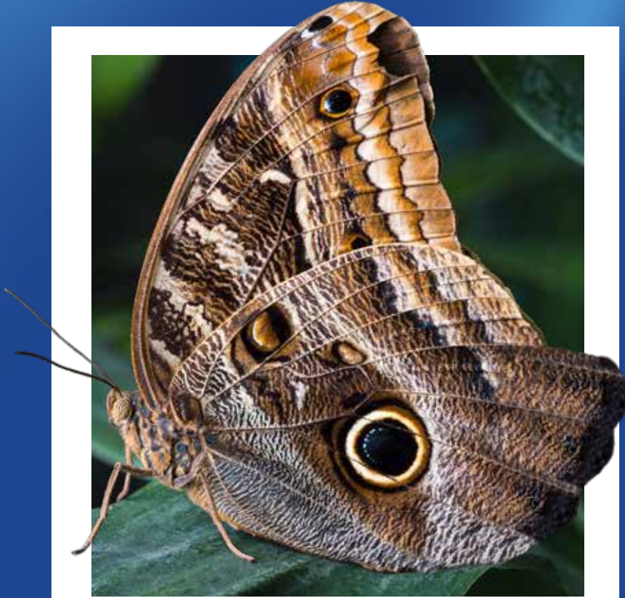
Heat Transfer Printting